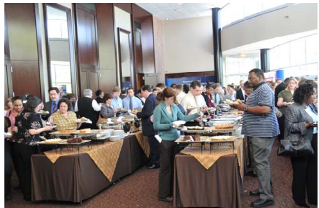
Lines of attendees enjoy a delicious buffet luncheon during the SOLE Symposium at the Sheraton Eatontown.